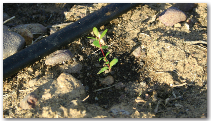
Newly planted seedling