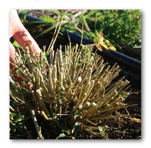
Freshly cut buchu bush

Planted mostly in the Western Cape, in the field, this species requires soils with a low pH, ideally 3,5 to 4,5, but will tolerate a pH of up to 5,5. Soil salinity and phosphate should also be low. Phosphate levels should not exceed 15 ppm, but plants will tolerate up to 20 ppm. Soil nitrate levels should also be low. High potash and sulphur counts are found in their natural habitat.