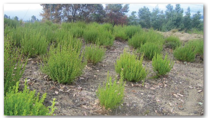
Buchu plants growing wild

goe (Afrikaans); Buchu (Khoi); Ibuchu (Xhosa)